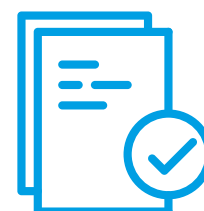
COVID-19 Recovery Plan for Air Navigation Services (ENAIRE)